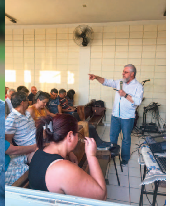
Pezini teaching in Brazil